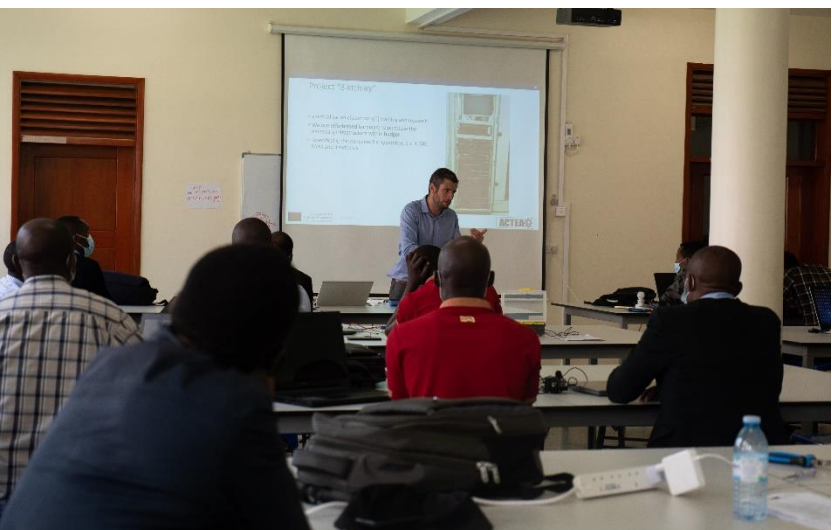
Day Sixteen 25/01/2022, Funding Meeting and visit to Nile Breweries

Presentations were held about different funding opportunities available to MUST and other partners. The day was capped with a visit and discussions with Nile Breweries Mbarara.